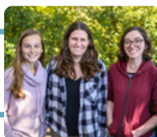
Improving Heat Preparedness in Wisconsin through a Health-Based Warning System