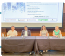
How Wisconsin Cities Use Science and Why Their Future Depends on It

Three Urban Futures talks including one Crossroads of Ideas panel and two Weston Roundtable Lectures