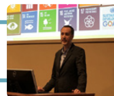
Why Waste a Good Opportunity? Interdisciplinary Approaches to Sustainable Resource Recovery and Carbon Capture